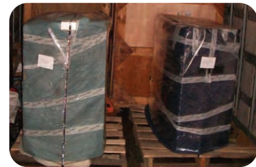
Uncrated, even if skidded