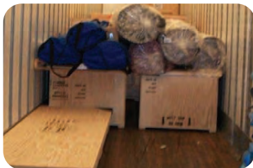
Carpet & Padding (shipped "loose")