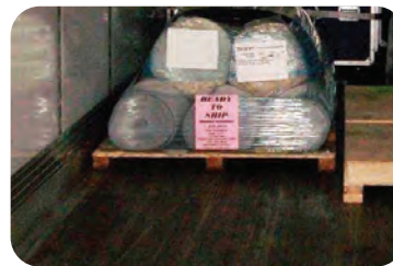
Carpet/Padding is not additional handling if skidded & floor loaded